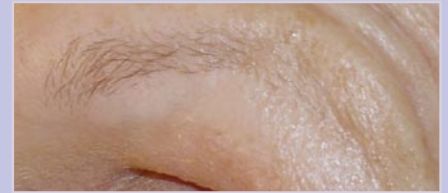
Before Permanent Makeup