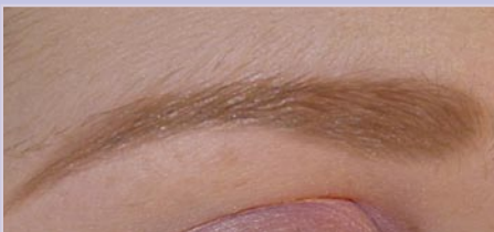
Results: 6 Months Later

Premier Pigments heals similar to the color implanted