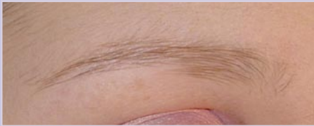
Before Permanent Makeup