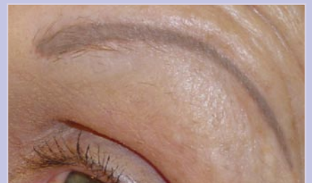
Results: 6 Months Later

Medium brown iron oxide pigment healed light brown.