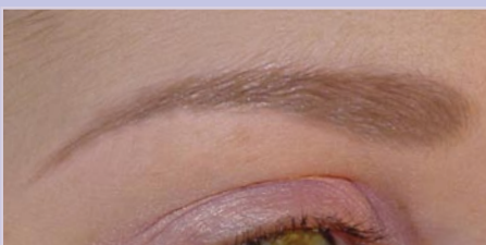
Results: 2 Years Later

Premier Pigments heals similar to the color implanted