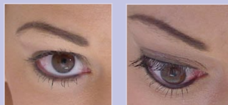
Premier Pigments after seven years