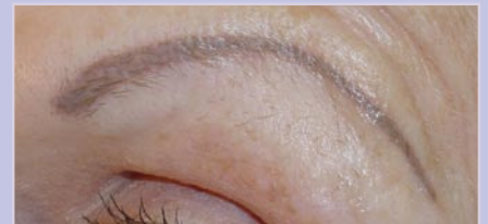
Results: Three Weeks After

Medium brown iron oxide pigment was applied.