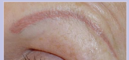
Results: 18 Months Later

Medium brown iron oxide pigment turned gray six months after.